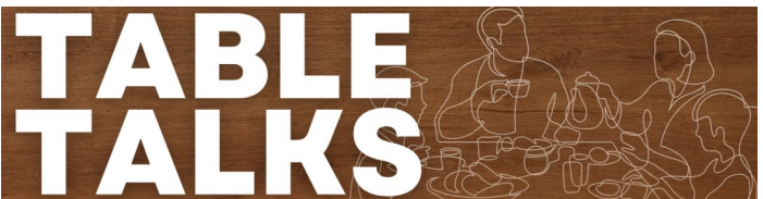
Table Talks: Parenting in a Digital World